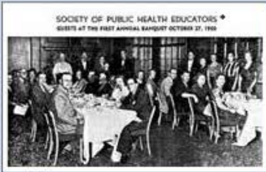
Circa 1950s *Name changed to Society for Public Health Education in 1969.

WHEN HEALTH EDUCATION PIONEERS gathered to write the first SOPHE bylaws, they helped recognize health education as a distinct profession and our dedication to promoting the health of all people.